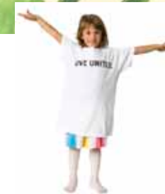
Top to bottom: kids at Alfond Youth Center's Camp Tracy, the 'many hands' imprint, a big LIVE UNITED supporter.