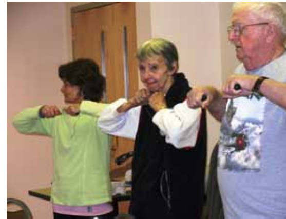
Participants in the Bone Builders class at HealthReach RSVP.

The team also helped with “Keeping Hearts Warm” this winter in coordination with the Meeting Immediate Human Needs CIT’s focus on “Keeping Mid-Maine Warm.” “Keeping Hearts Warm” was their third annual blanket drive and collected over 300 blankets for mid-Maine’s neediest community members so that they could stay warm throughout the cold Maine winter. This project was in coordination with “Make A Difference Day” Saturday, October 23.