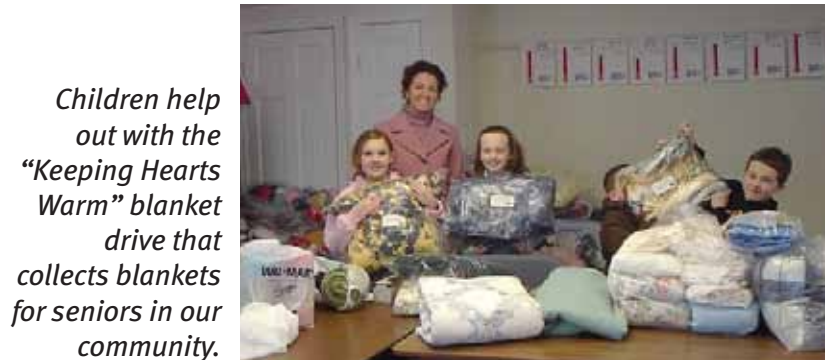
Children help out with the “Keeping Hearts Warm” blanket drive that collects blankets for seniors in our community.