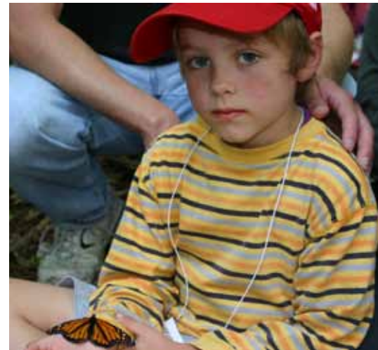
A camper at Camp Ray of Hope, a program of Hospice Volunteers of Waterville Area.